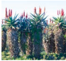
Aloe speciosa (tilt-head aloe)