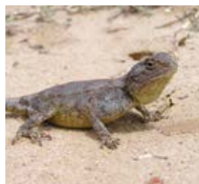
Southern rock agama