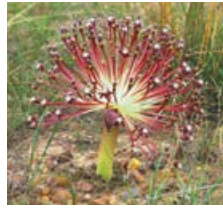
Crossyne guttata (parasol lily)