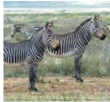
Cape mountain zebra