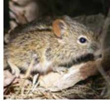
Four-striped field mouse