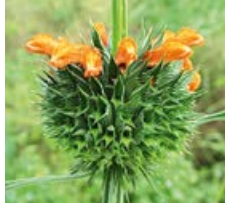
Leonotis ocyimifolia (minaret flower)